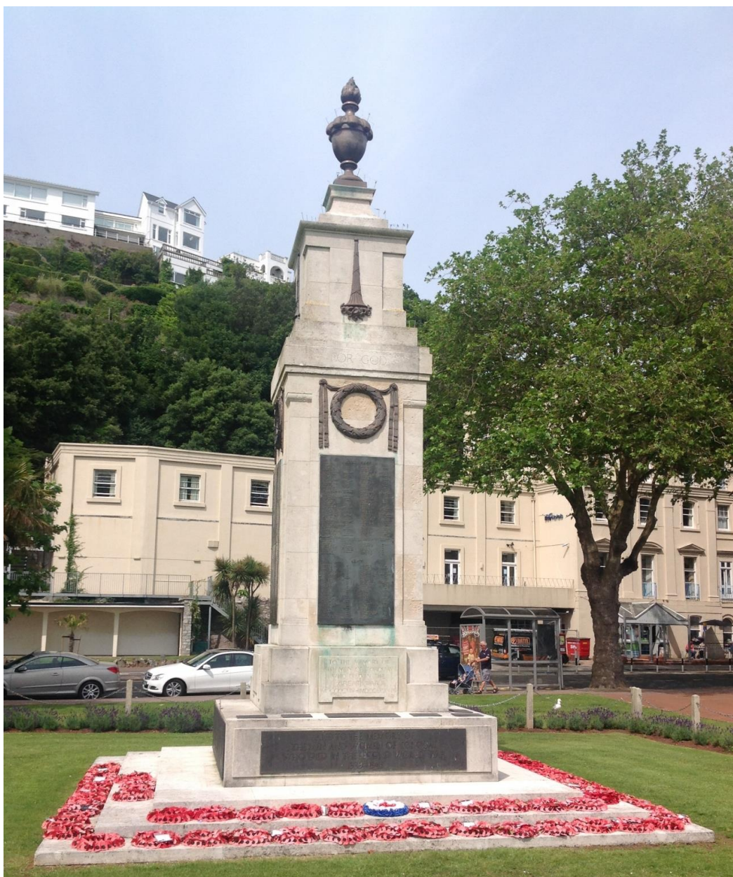
Torquay War Memorial