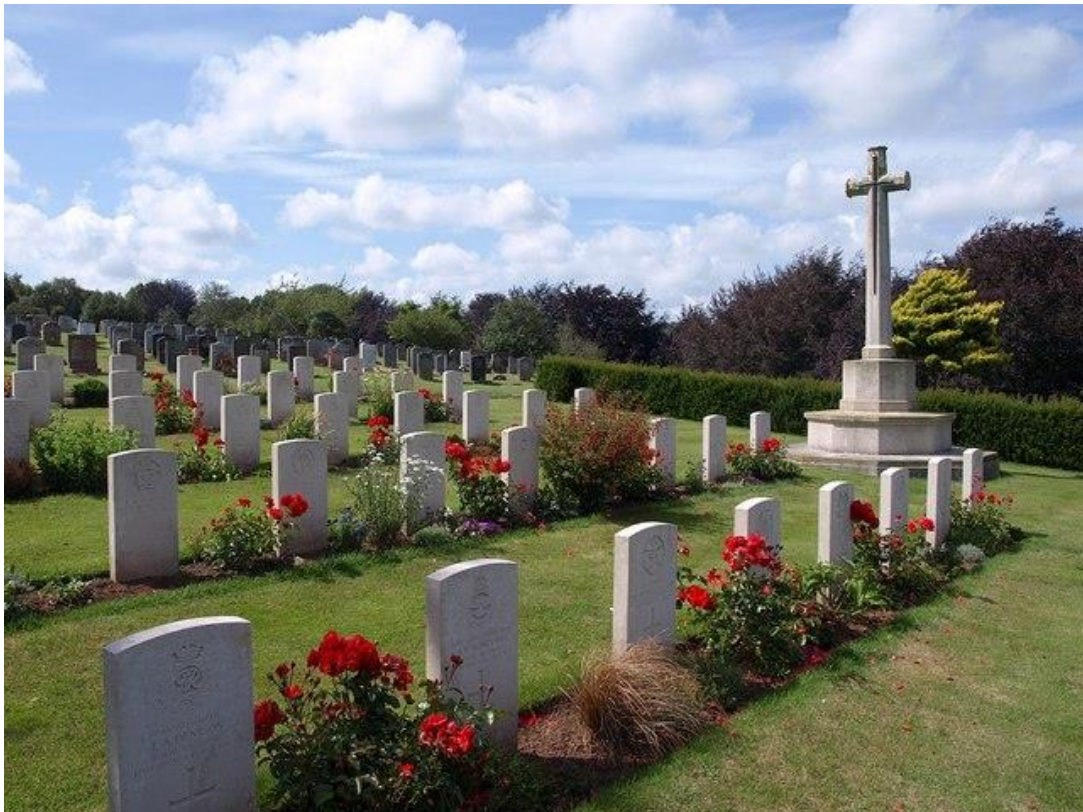
War Graves in Torquay Cemetery