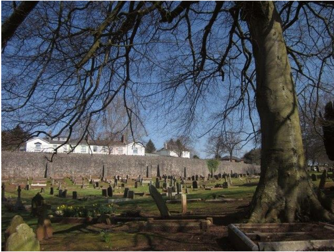
Part of Torquay Cemetery

Torquay Cemetery and Extension contains 136 burials of the First World War, 32 of them forming a small plot in the south-west corner of the old part, near a small group of New Zealand graves (a small New Zealand Discharge Depot was formed at St. Mary's Church at the end of 1916). Of the 97 Second World War graves, 50 are in a war graves plot in the eastern part of the extension, the rest scattered.